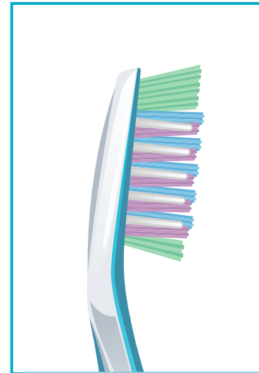
HEAD : To ensure comfortable brushing, choose the size and shape that best fit your mouth.