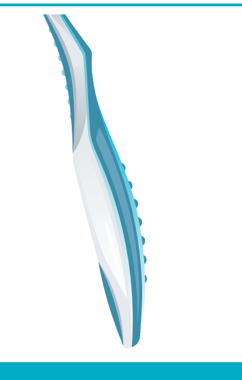
HANDLE: Choose whichever shape is easiest for you to grip comfortably.